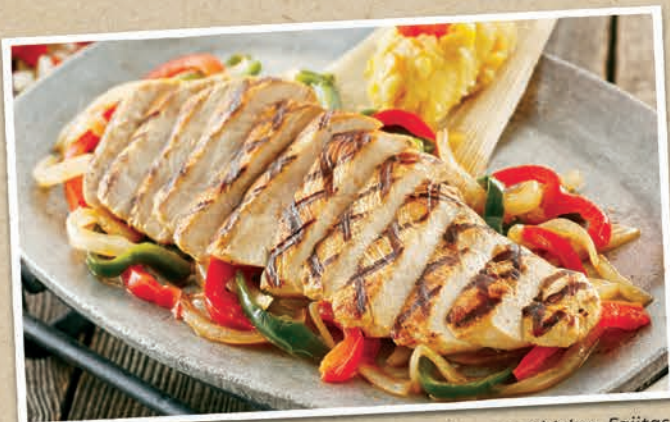
Famous Chicken Fajitas

A bowl of rich chicken broth with diced onion, tomato, roasted corn, jalapeños, grilled chicken, crispy tortilla strips, cotija cheese and fresh Hass avocado. 4.99