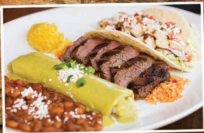
Surf N' Turf

All favorites are served with Fresh Mex® rice and grilled veggies.