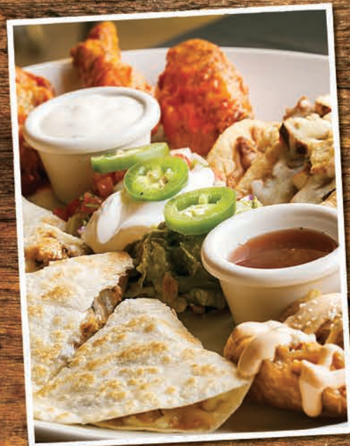
Fresh Mex™ Sampler

A heaping platter of crispy chips topped with Salsa Chicken or Picadillo Beef, sour cream, refried beans, New Mexico red chile sauce, chile con queso, fresh guacamole and pico de gallo. 9.99