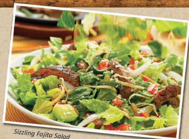
Sizzling Fajita Salad

Two Salsa Chicken Enchiladas served with Fresh Mex® rice and grilled veggies. 6.99