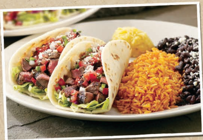
Mesquite-Grilled Steak Tacos

Served with Fresh Mex® rice and your choice of homemade beans a la charra, refried beans or vegetarian black beans.