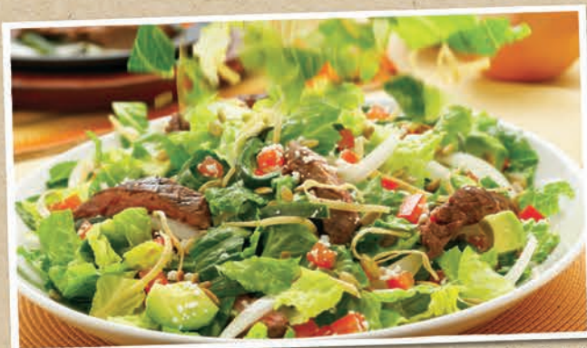
Sizzling Fajita Salad

Shrimp sautéed with fresh diced garlic, white wine and citrus juices over rice. 8.99