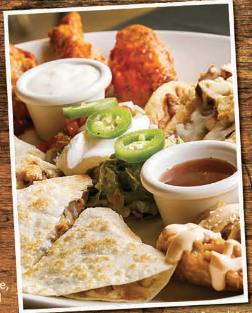
Fresh Mex™ Sampler

A heaping platter of crispy chips topped with Salsa Chicken, sour cream, black beans, New Mexico red chile sauce, a trio of melted cheese, fresh guacamole and roasted corn salsa. 9.99 w/Steak or Combo +1.49