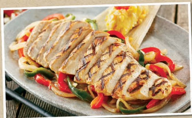
Famous Chicken Fajitas