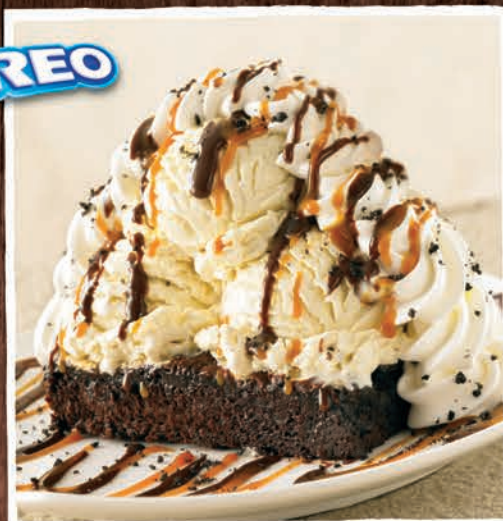
Oreo Ooey-Gooey-Chewy Sundae