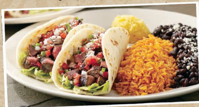
Grilled Steak Tacos

Served with Fresh Mex® rice, our signature sweet corn tamalito and choice of homemade Beans a la Charra, Refried Beans made with bacon or Vegetarian Black Beans.