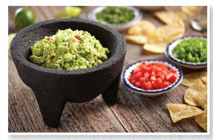
Fresh Tableside Guac