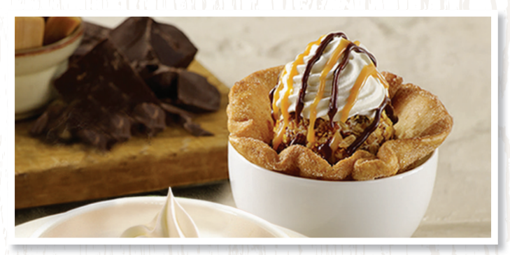
DEEP-FRIED ICE CREAM