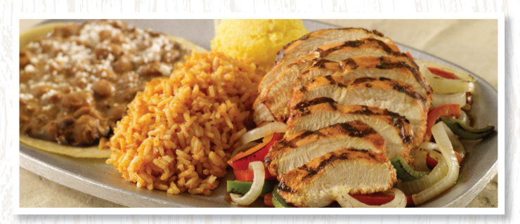
LUNCH SIZE SIZZLING CHICKEN FAJITAS