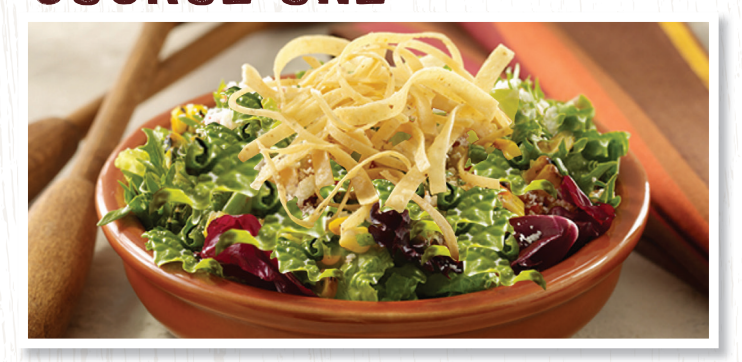
MIXED GREENS SALAD