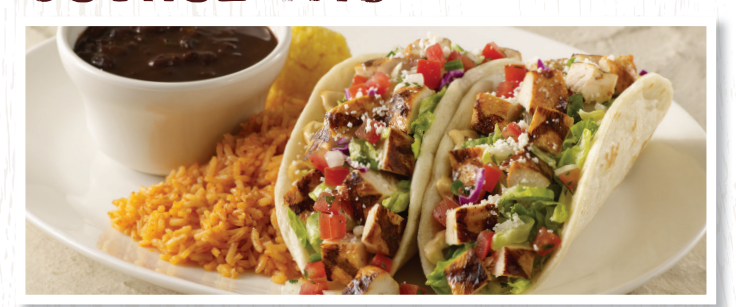
GRILLED CHICKEN FAJITA TACOS